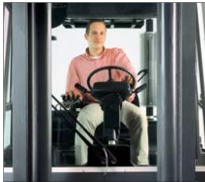
Excellent visibility through the mast