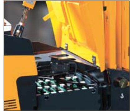
Foldable battery cover