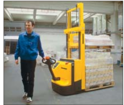
Doubledeck transport of two pallets

tiller switch also facilitates manoeuvring with the tiller in upright position.