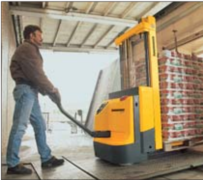
Travel over loading ramp with EJC Z