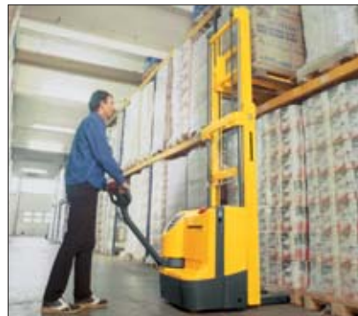
Stacking with EJC Z14

Space-saving through crawl speed button: to reduce the turning radius, the separate