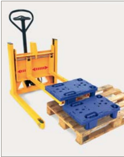
Handling a quarter pallet