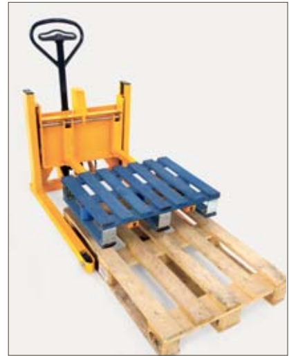
A half pallet is picked up from a standard Euro pallet