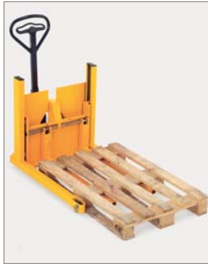
Handling a standard Euro pallet