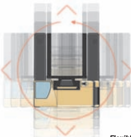
Flexible in all directions