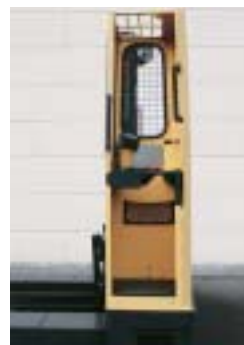
stand up cabin

HUBTEX offers a variety of driver's cabins to adapt to the truck for use in existing aisles or any desired aisle width. The ergonomically designed driver's control centre offers optimum use of space with maximum freedom of movement and a superb view of loads and operating area for fast safe operation. A combination of vibration damped cabin mountings and fully adjustable spring suspension seat provides a fatigue-free, quiet workstation. In all cases driver's access allows the truck to be parked "In aisle". As option, for unheated warehouses, enclosed and heated cabins can be specified.